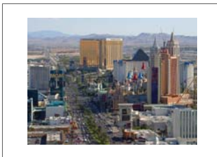
Join us in Las Vegas in 2010

This conference will provide a high-quality CME opportunity for west coast physicians on a par with the Fall Foliage Conference.