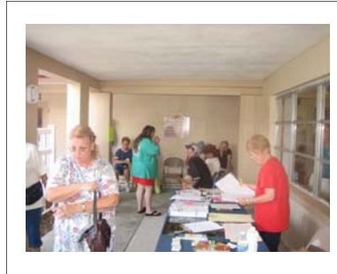
Attendees wait to be screened for skin cancer courtesy of Associates in Dermatology

applications, including the United Way, Lee County Health Department, Visually Impaired Persons, and Family Health Centers. Over 2,500 pounds of emergency food from the Harry Chapin food Bank was distributed to help with southwest Florida's hunger crisis. Professional hair cuts were donated by Planet Hair, and the Lee Memorial Hospital Blood Mobile left with many extra pints. With around 150 attendees, more than 35 volunteers, lots of door prizes, food, and helpful information, the event was quite a success!