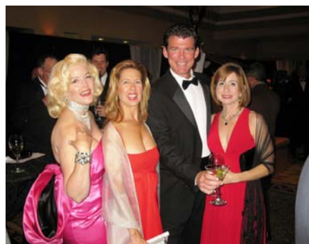
Guests pose with "Marilyn Monroe" and "James Bond" at the 21st Century C.A.R.E. gala event in Jan.

The staff at 21st Century C.A.R.E. will help you plan, organize, and carry out your event. Here are some ideas