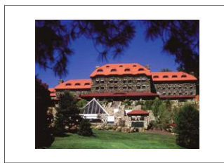
The Grove Park Inn

The overall theme of this year's conference is "Increasingly Targeted Cancer Therapies".